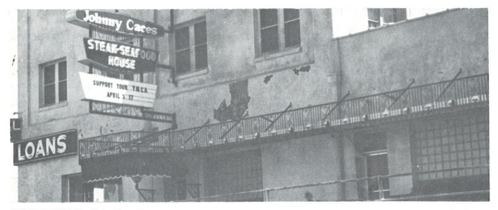
JOHNNY CACES—Downtown Longview—102 N. Green. Highly recommended for excellent service and quality foods, especially steaks. Opens 7 A.M. Closes 2 A.M.

Other places of interest to SALT MINE—Grand Sali BOWLING ALLEY—Gla SKATING RINK—Gregg LONE STAR STEEL—L MINIATURE GOLF-Gre GOLF COURSES-Longv