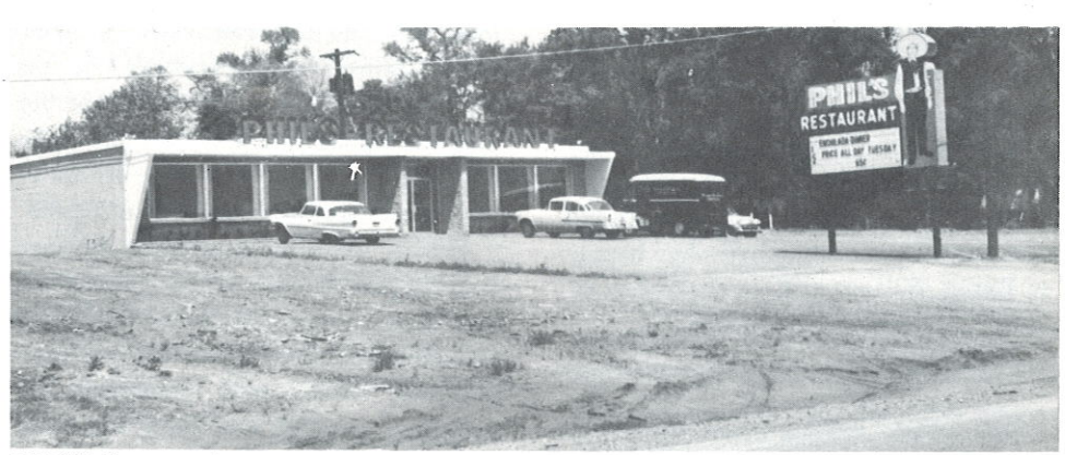
PHILS—1 mile west of Longview on Kilgore-Longview Highway. First class Mexican food, friendly service. Opens 10 A.M. Closes 10 P. M.