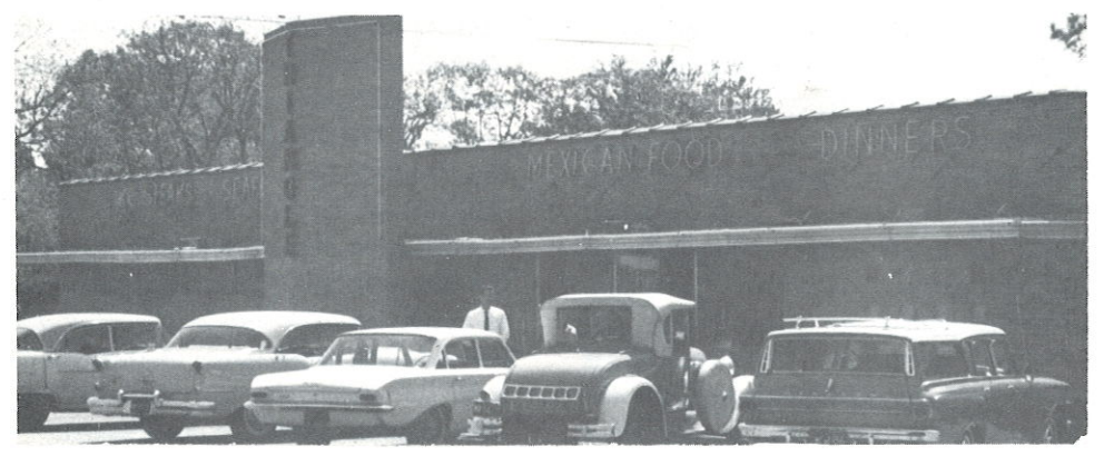
TRIANGLE—Longview. 1028 E. Marshall. Excellent service in a clean modern place with good food and reasonable prices—parties welcome. Opens 5:30 A.M. Closes 1 A.M.

Other places of interest to SALT MINE—Grand Sali BOWLING ALLEY—Gla SKATING RINK—Gregg LONE STAR STEEL—L MINIATURE GOLF-Gre GOLF COURSES-Longv