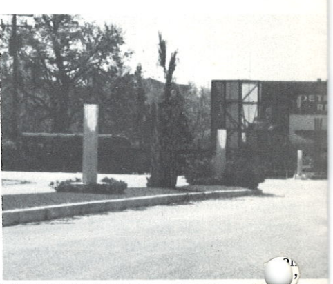
PETROLEUM CLUB—Longvie Westerner Motel. The place to go P.M. Closes 12 P.M. weeksdays,