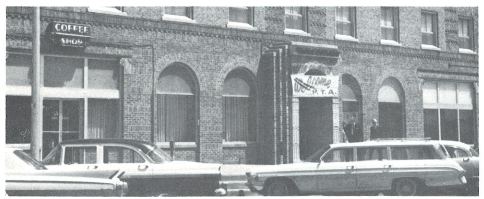
LONGVIEW HOTEL—215 E. Methvin. Very good food. Reasonable prices, good service. Opens 6 A.M. Closes 9-9:30 P.M.

Where can I purchase a steak fit for any gourmet's palate? If I were searching for a suitable place to dance, where must I direct my steps? I have always been addicted to golf. Might someone show me the whereabouts of a golf course? Industry has always fascinated me. I would appreciate being advised as to where I might observe major industries in action.