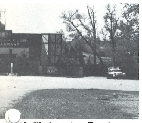
7. 1310 Gladewater Road, near for eating and dancing. Opens 3 A.M. Sunday morning.