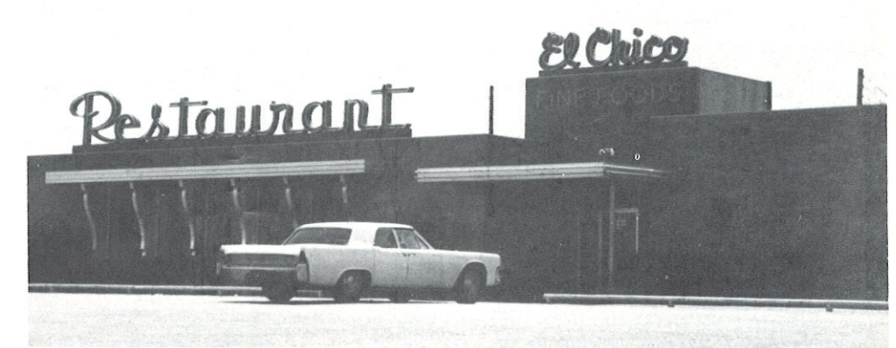
EL CHICOS—Longview. 1500 E. Marshall (Highway 80) Original home of Mexican food. Opens 11 A.M. Closes 10 P.M.

ered by these statements, then read on! In consideration of the fact that some are "fledglings" in the East Texas area, or have just failed to familiarize themselves with our prominent eating and recreational establishments, the following evaluation of the services and opportunities of this area has been compiled. It is our hope that this will be of assistance to you in planning your future "night out."