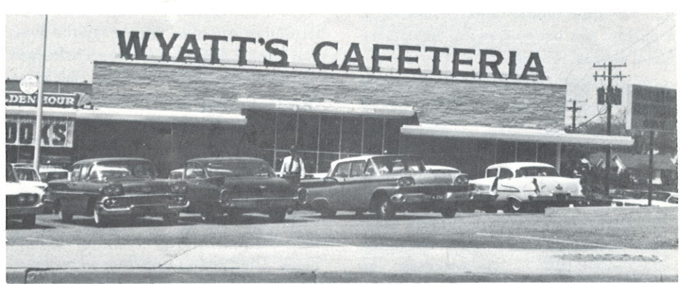
WYATT'S CAFETERIA—Earlee Shopping Center, Longview. A very up-to-date modern eating place where you can see what you are getting. Opens 11 A.M. Closes 8:30 P.M.